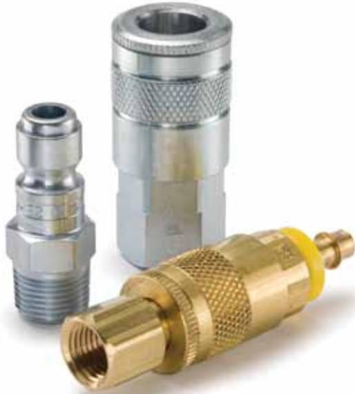
Performance 10 Series (1/4", 3/8", 1/2" sizes)