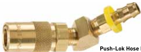
Push-Lok Hose Barb