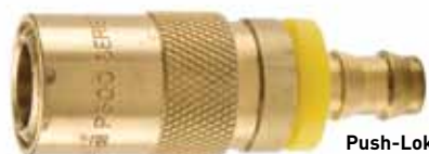
Push-Lok Hose Barb