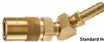
Standard Hose Barb