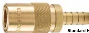
Standard Hose Barb