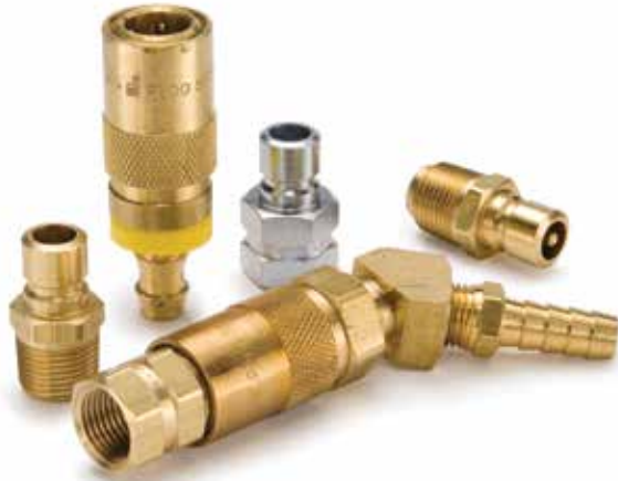
Performance Moldmate Series (1/4", 3/8", 1/2") Test Fluid: Water (Straight Coupler)