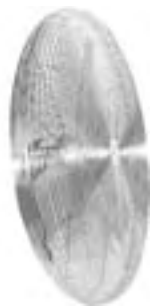
Non-Oscillating Head Assembly