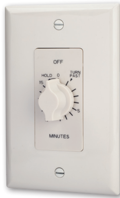
*Wallplate not included