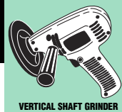
VERTICAL SHAFT GRINDER