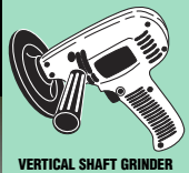
VERTICAL SHAFT GRINDER

The tool-free, twist-on and off fastening systems make fast work of disc changes to maximize productivity by minimizing downtime.