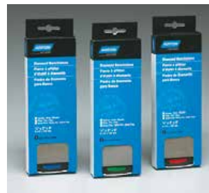
6" STONES COME RETAIL PACKAGED