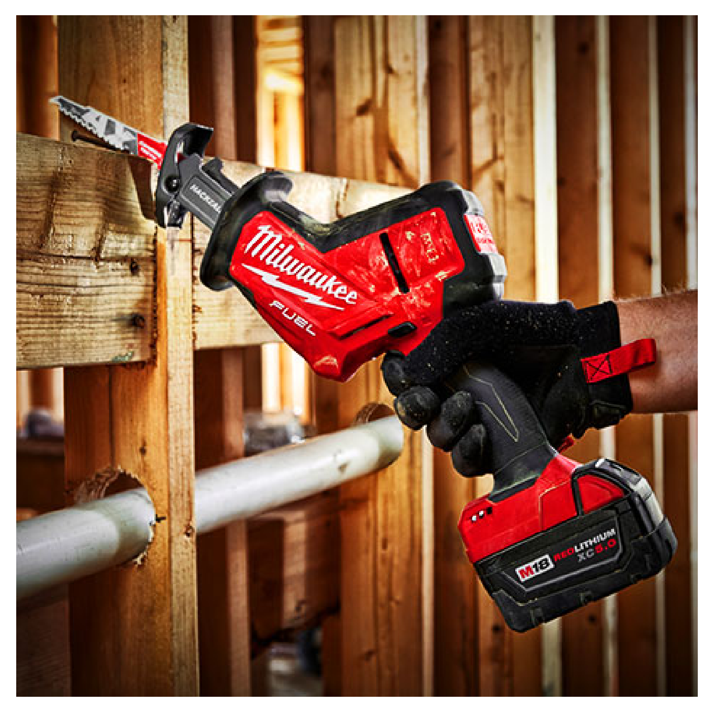
Cuts up to 50% faster than competitive one-handed recip saws

Up to 4x lower vibration for smooth cut starts & one-handed control