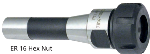
ER 16 Hex Nut ER 20 - 40 Round Nut