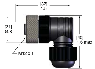
Female Right Angle