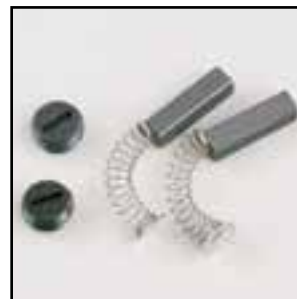
Replacement Brush, Cap and Spring Kit (2 each)