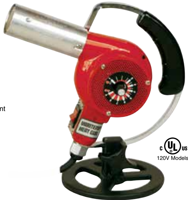
Pivoting stand and adjustable slide grip handle