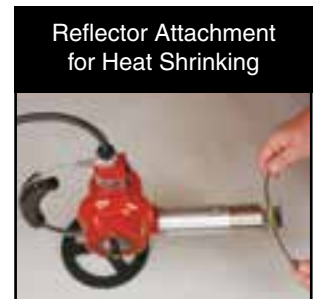
Reflector Attachment for Heat Shrinking