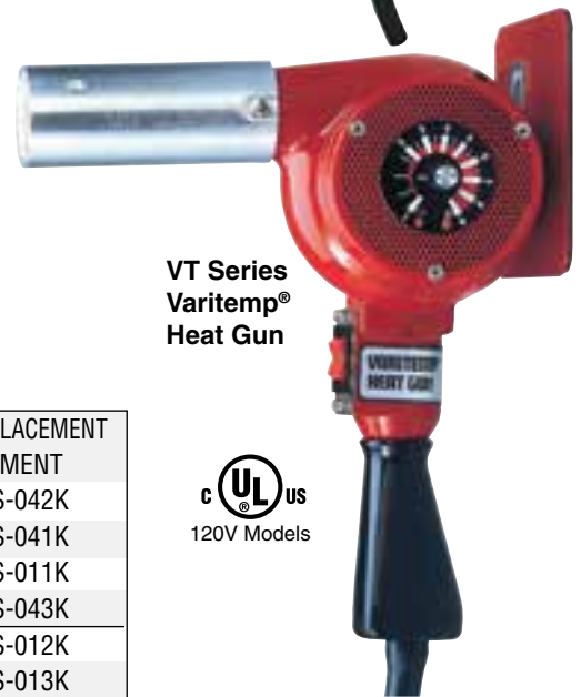
VT Series Varitemp® Heat Gun