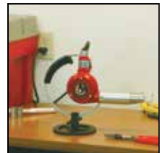
Perfect for bench-top use in manufacturing and repair

NOTE: Users should independently evaluate the suitability of the product for their application.