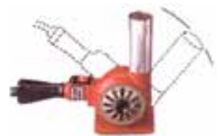
Rotating Swivel Stand