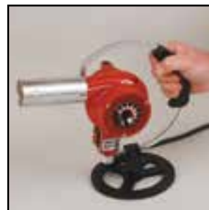
Ergonomic handle with spring loaded slide grip