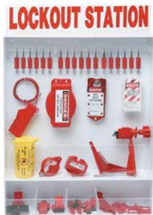
Shown without optional lockable clear acrylic door