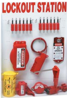
Shown without optional lockable clear acrylic door