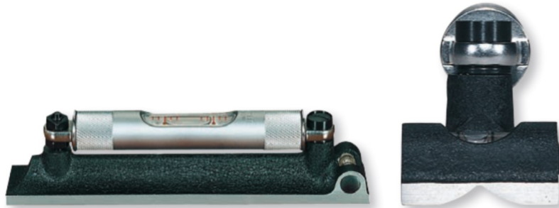
End view showing involute groove

The 6" through 18" (150-450mm) main level vials have graduations that are approximately 80-90 seconds or .005" per foot (0.42mm per meter). There are five, six, or seven lines on each side of the bubble, depending on the base length.