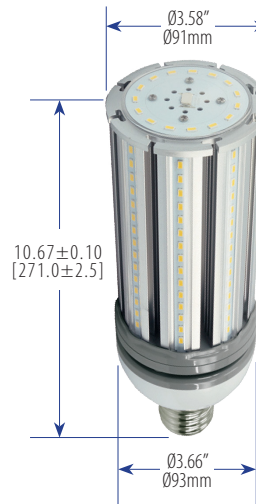
54 WATTS Replaces up to 150W MH & HPS

Installation for Vertical Position Only: Base Up or Base Down