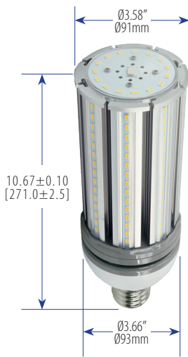
45 WATTS Replaces up to 150W MH & HPS