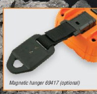
Magnetic hanger 69417 (optional)