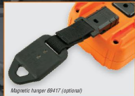
Magnetic hanger 89417 (optional)