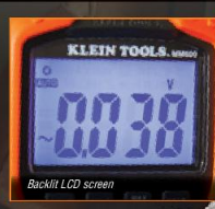
Backlit LCD screen

The MM600 and MM700 include a nylon carrying pouch, test leads, alligator clips, batteries and thermocouple with adapter.