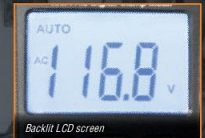
Backlit LCD screen

Also available: CL110KIT Electrical Maintenance & Test Kit. Includes CL110 Clamp Meter, RT210 GFCI Receptacle Tester and 69409 Line Splitter-10x, nylon carrying pouch, test leads and batteries.