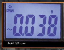
Backlit LCD screen