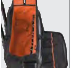
Wide open interior to accommodate large tools.