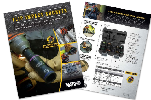
Digital Sell Sheet

For further information regarding this product, contact your local sales representative.