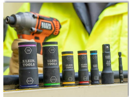
Ten sizes in five sockets plus two nested adapters