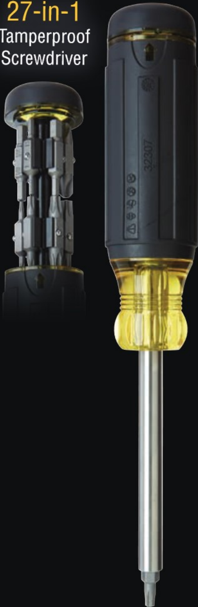
27-in-1 Tamperproof Screwdriver