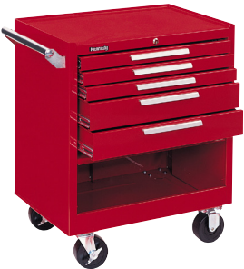
295B / 295R / 295BKW