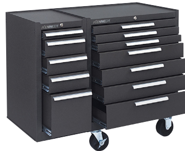
205B / 205R / 205BKW Hang-on Side Cabinet