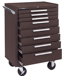
378XB / 378XR / 378XBKW