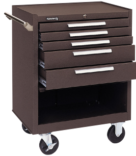
275B / 275R / 275BKW