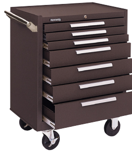
277B / 277R / 277BKW