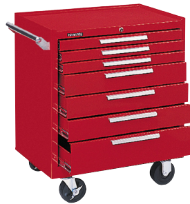
297B / 297R / 297BKW