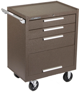
273B / 273R / 273BKW

K Series Industrial cabinets feature friction or ball bearing drawer slides, tubular end handle, & rugged 5 x 2" roller bearing casters.