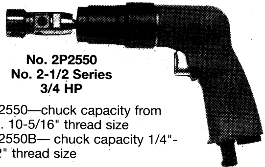
No. 2P2550 No. 2-1/2 Series 3/4 HP