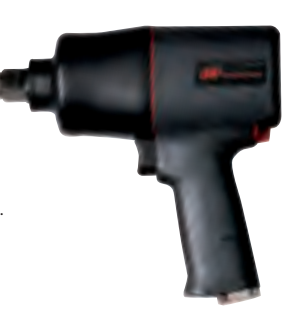
The best power-to-weight ratio in its class