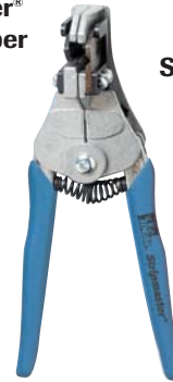
Stripmaster® Lite Wire Stripper