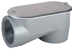
SLB-1 thru 7