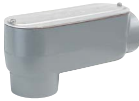
SOLB-8, 9, 0