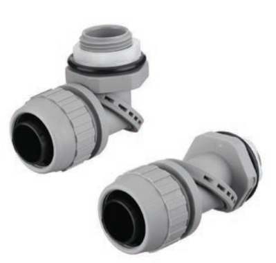
PS0509NGY SwivelLok® Multi-Position