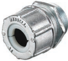
Cast Aluminum Malleable Iron