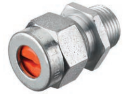
Machined Zinc-Plated Steel