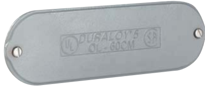
Cast Iron Covers