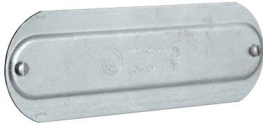
Aluminum and Steel Stamped Covers