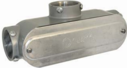
T Type - COT-4,5,6