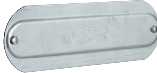
ALUMINUM STAMPED COVER