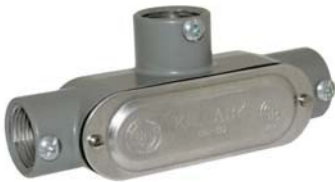
T Type - COT-1,2,3