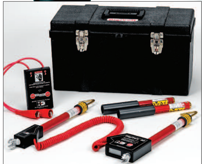
DVM-80 Kit with PT-5000B Proof Tester® and pair of R-80 add-on resistors