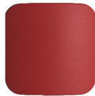
Locking Button Top View