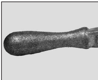
SAFER, MORE COMFORTABLE GRIP

NOTE: SAFE PRACTICES & PROCEDURES CAN BE FOUND ON PAGE 8 OF THIS CATALOG.