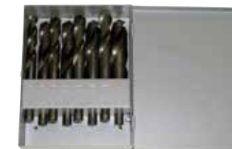
8-piece set Style 1813 EDP No.C21135