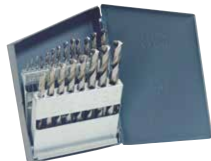
21-piece set Style 1898 EDP No.C21113