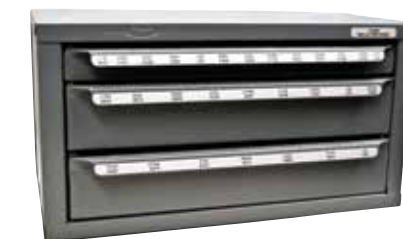
Drill Dispenser EDP No.C23992

CLE-FORCE™ Drill Sets are listed on page 67