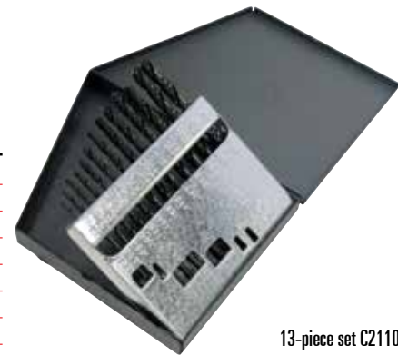
13-piece set C21105