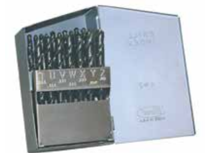
26-piece set Style 1899 EDP No.C21158