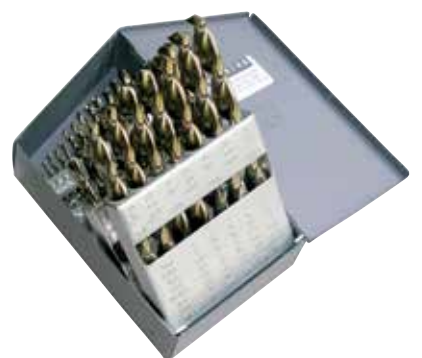
29-piece set Style 1872 EDP No.C18622