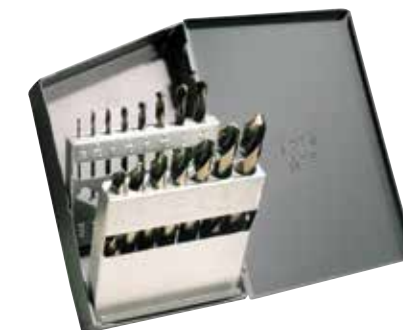
15-piece set Style 1875 EDP No.C21160