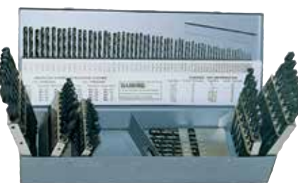
115-piece set Style 1899 EDP No.C21127