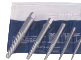
5-piece set Style 1829 EDP No.C21149