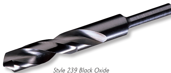
Style 239 Black Oxide