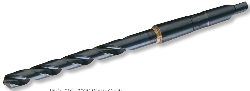
Style 110, 110S Black Oxide