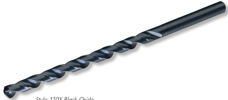
Style 120X Black Oxide