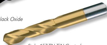
Style 157-TN TiN-Coated