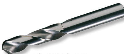
Style 157 Bright Finish