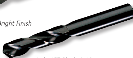
Style 157 Black Oxide