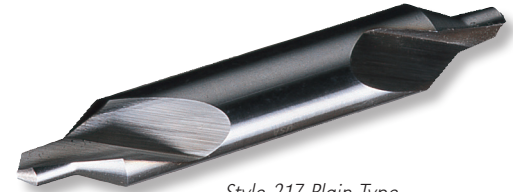
Style 217 Plain Type