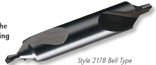
Style 217B Bell Type