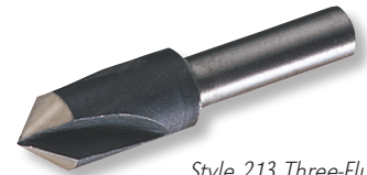
Style 213 Three-Flute