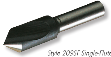
Style 209SF Single-Flute