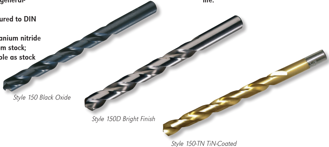
Style 150 Black Oxide