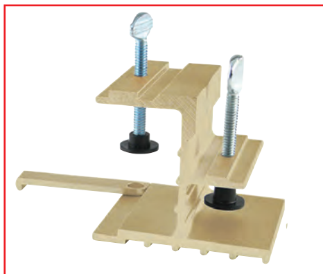
NEW COLOR SHOWN