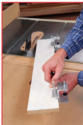
NEW COLOR SHOWN