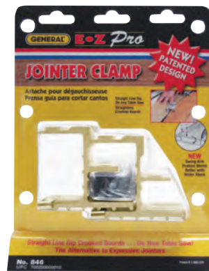
NEW COLOR SHOWN