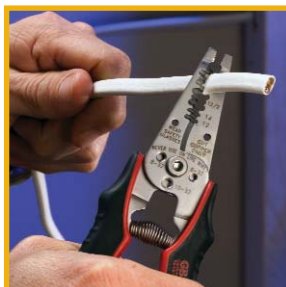
12/2 and 14/2 NM Cable Stripper