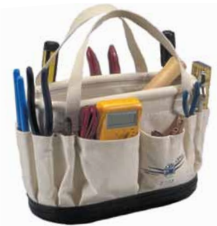
1815 TOOLS NOT INCLUDED