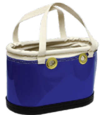
1820-H-HB 15" L X 7" W X 9" H

A variation of our 1820-HB-C bucket, featuring an additional magnet to keep nuts, bolts, and washers readily at hand.