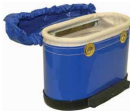
1820-HB-C1-MAG 15" L X 7" W X 9" H

Hardbody reinforced, this bucket comes with 15 interior pockets and a built in bucket cover.