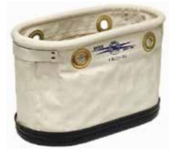
1820-4G 15" L X 7" W X 9" H

A variation of our 1820 bucket, features the addition of a magnet to keep nuts, bolts, and washers readily at hand.