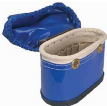
1820-HB-C 15" L X 7" W X 9" H

A vinyl variation on our standard aerial oval bucket, this comes with 15 inside pockets and 2 grommets for hanging.