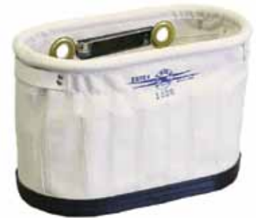
1820-MAG 15" L X 7" W X 9" H

This oval bucket features reinforcing Hard Body plastic on all sides to keep the bucket rigid, as well as 15 inside tool pockets for organization. It hangs on the aerial lift with attachment hooks. There is a PVC ring in the top to shape the opening as with all Estex oval buckets. Holes for attachment hooks are reinforced with brass grommets, and the base of the bucket is built from sturdy plastic with built in drainage holes.