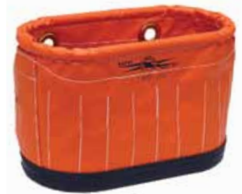
1820-SCE 15" L X 7" W X 9" H

With 15 pockets, and 4 grommets for hanging, this is one of our more versatile canvas oval buckets.