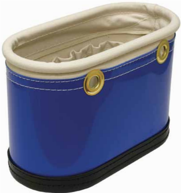
1820-HB 15" L X 7" W X 9" H

This oval bucket features reinforcing Hard Body plastic on all sides to keep the bucket rigid, as well as 15 inside tool pockets for organization. It hangs on the aerial lift with attachment hooks. There is a PVC ring in the top to shape the opening as with all Estex oval buckets. Holes for attachment hooks are reinforced with brass grommets, and the base of the bucket is built from sturdy plastic with built in drainage holes.