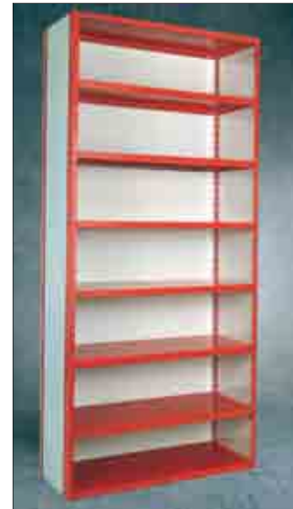
Closed back and end

To order set-up (extra charge), change "KD" suffix to "SU".