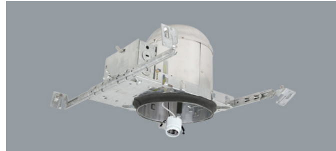
DESIGNED FOR 2" X 8" JOIST CONSTRUCTION