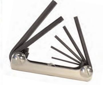
A variety of Hex and Ball-Hex Sets are available, covering the full range of inch and metric sizes