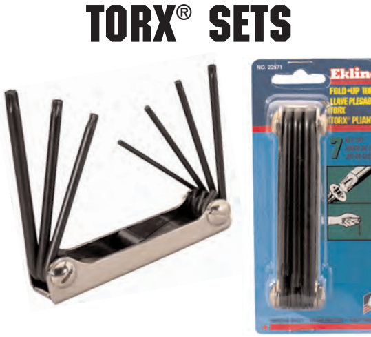
Torx<sup>®</sup> sets cover a wide scope of applications including; automotive headlights, taillights and trim, power tools, carbide inserts in cutting tools, appliances and electronics.