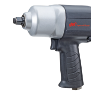
2100G Impact Wrench