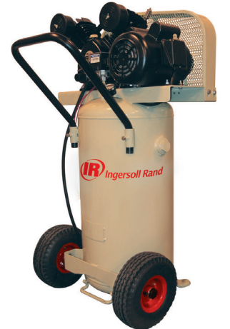
P1.5IU-A9 Garage Mate Reciprocating Air Compressor