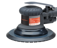
300G Random Orbital Sander