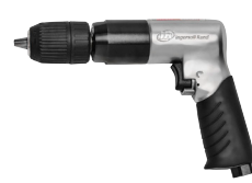
EC112 Air Drill