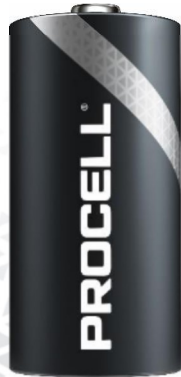
Size: C (LR14) PC1400