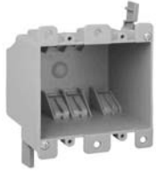
TP3490 (Old Work)