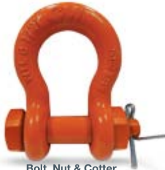
Bolt, Nut & Cotter