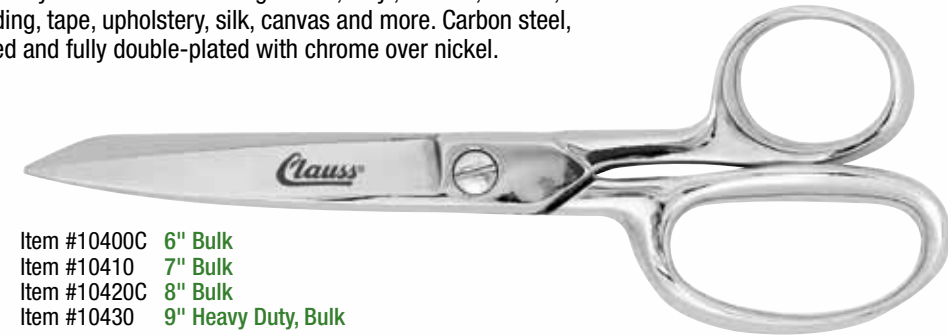
Item #10400C 6" Bulk Item #10410 7" Bulk Item #10420C 8" Bulk Item #10430 9" Heavy Duty, Bulk

Hot Forged Straight Trimmers are our most widely used general utility shears. Sturdy construction and adjusted precisely. These shears will cut a wide variety of materials including rubber, vinyl, textiles, leather, plastics, cording, tape, upholstery, silk, canvas and more. Carbon steel, thru-hardened and fully double-plated with chrome over nickel.