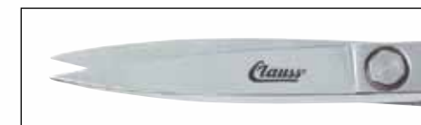
Item #10540C Knife Edge, Bulk