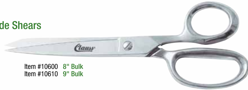
Item #10600 8" Bulk Item #10610 9" Bulk