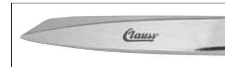
Item #10520C 8" Knife Edge, Bulk