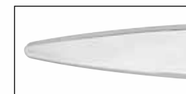
Item #1044005 Round Points, Bulk