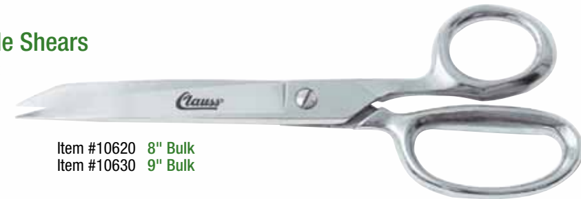
Item #10620 8" Bulk Item #10630 9" Bulk