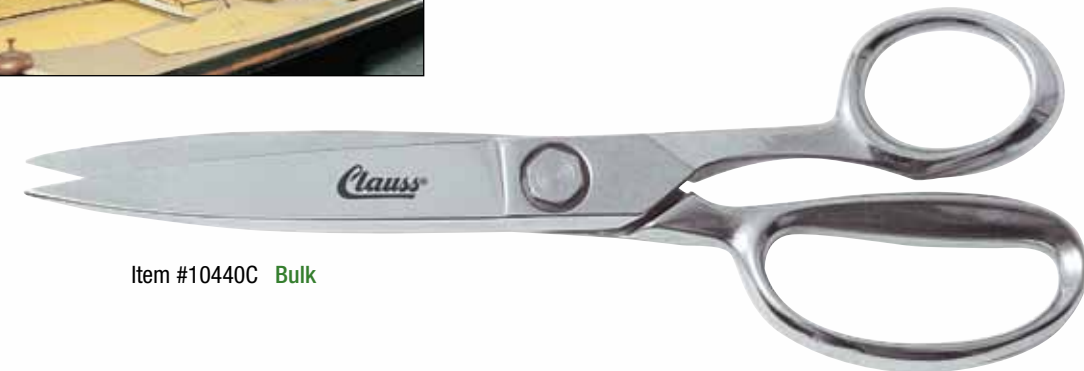
Item #10440C Bulk

Hot Forged, Heavy Duty Straight Trimmers are adjustable and feature "wide body" blades. Large Comfortable Handles. Hot Forged carbon steel, thru-hardened to ensure reliable performance and fully double-plated chrome over nickel. Use when working with upholstery, rubber, rubberized belting, plastics, fiberglass, textiles, fabrics and heavy cord.