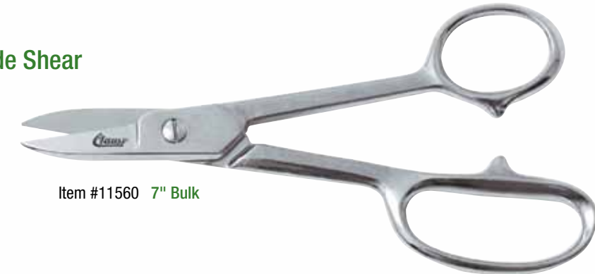
Item #11560 7" Bulk